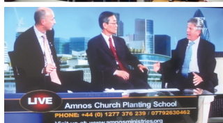
Live interview on Faith TV